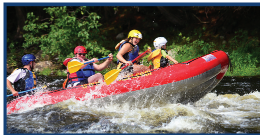
CTP White Water Rafting Adventure