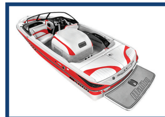
Malibu Ski Boat